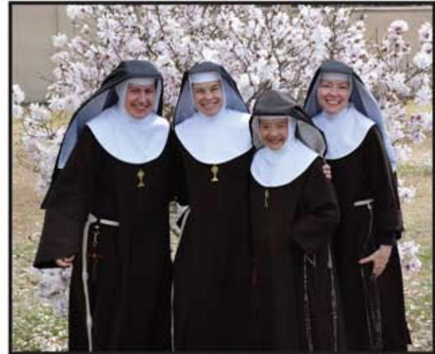
Sisters enjoying the beautiful weather!